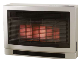
Ultima II in Gunmetal