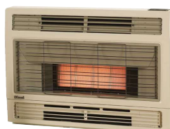
Spectrum in Beige