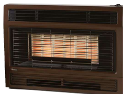
2001 in Brown